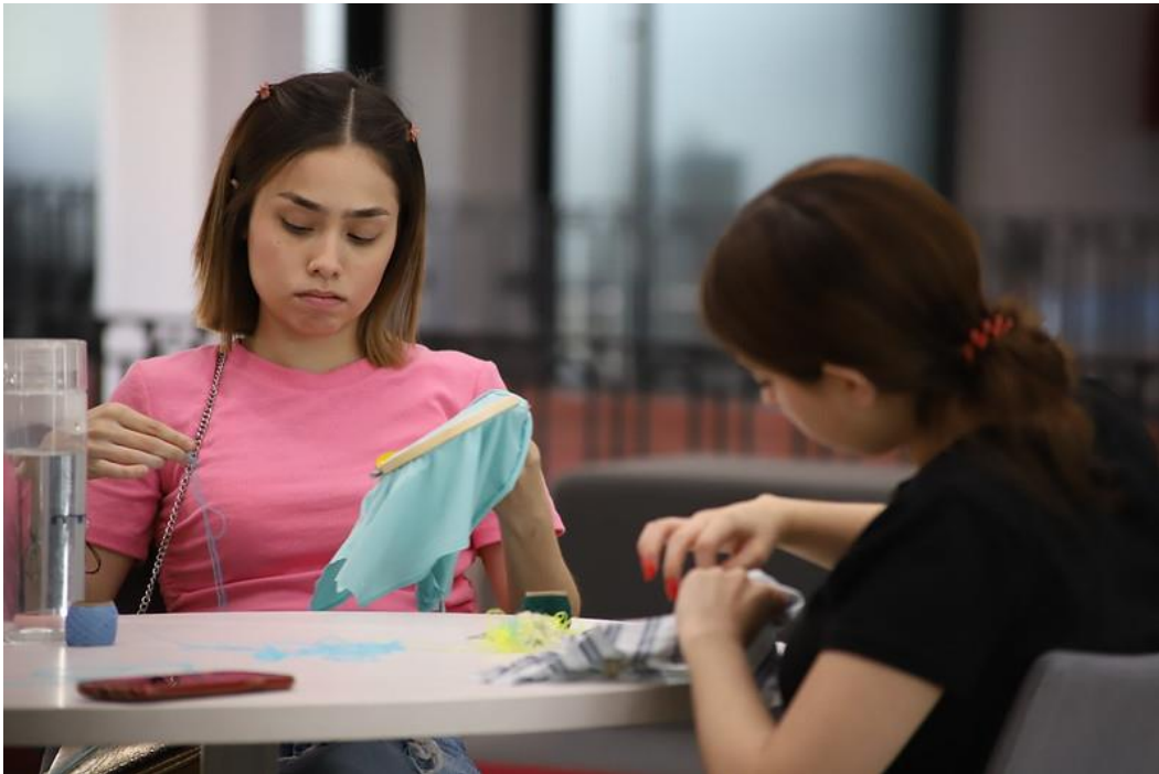
Open Session | Receiving the general public to get involved in the process