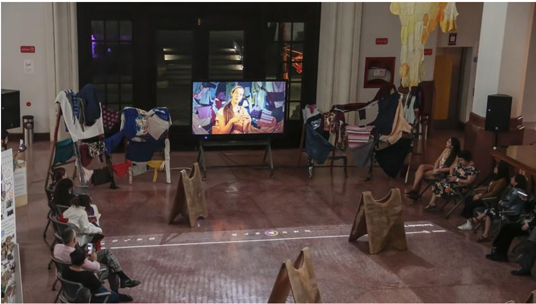
Zurciendo Vacíos Prototype Presentation | Atrio LABNL