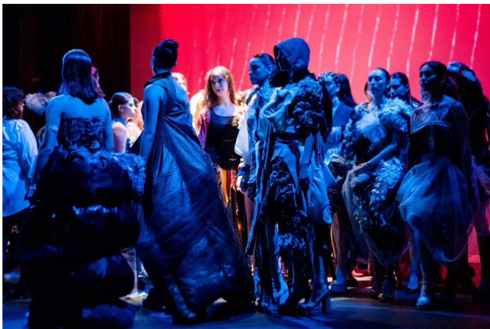
Experimental Catwalk Zurciendo Vacíos | All pieces together on stage