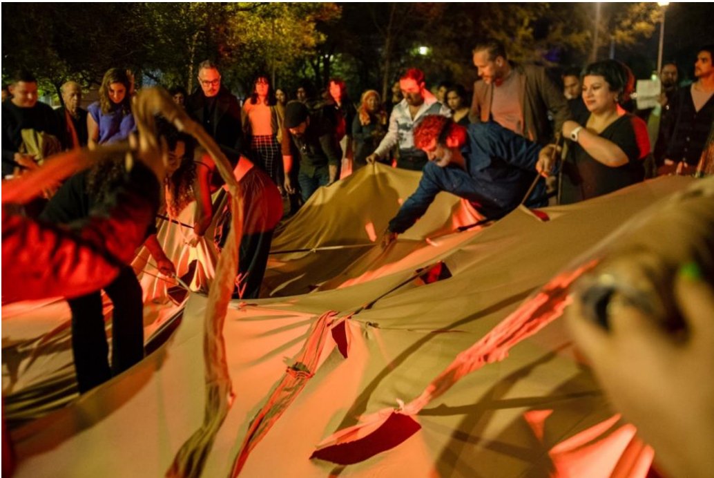
Performance Zurciendo Vacíos | Performers mending and darning fabric with reused tights