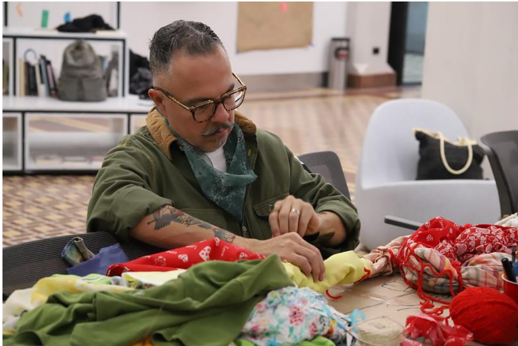
3 rd Prototype Session | Work in Progress