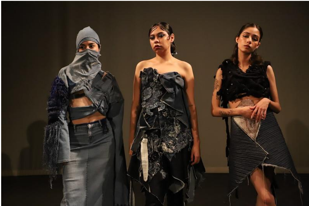
Experimental Catwalk Zurciendo Vacíos | CRGS UDEM designs