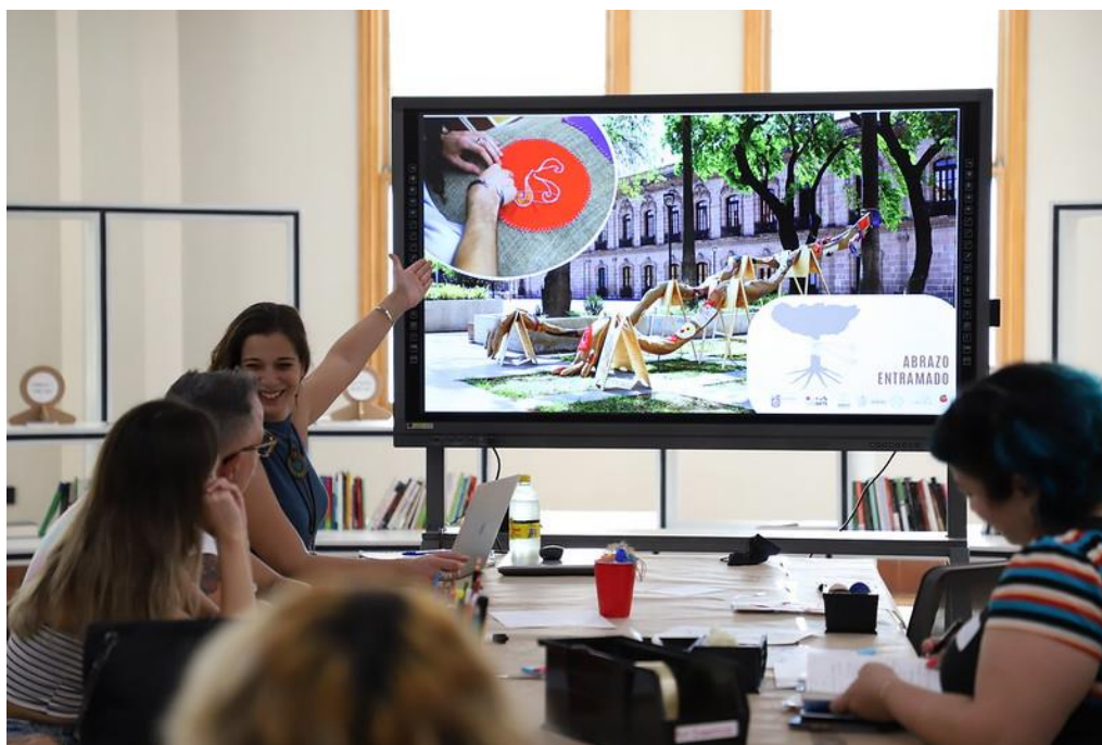
2 nd Prototype Session | Presenting project to new collaborators