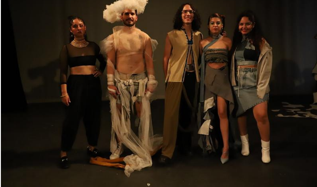
Experimental Catwalk Zurciendo Vacíos | LABNL designs