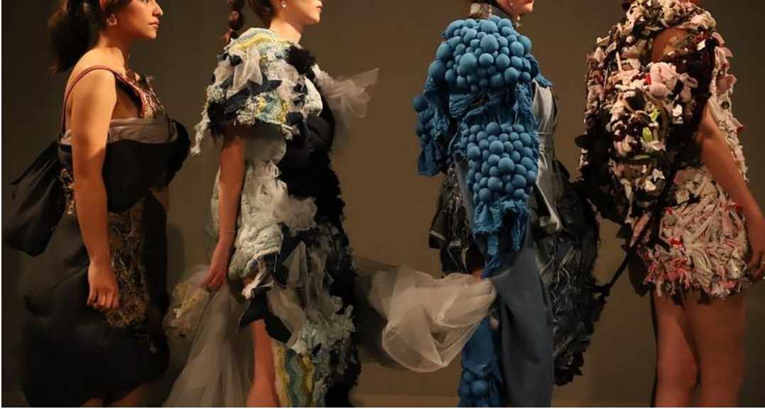
Experimental Catwalk Zurciendo Vacíos | CRGS UDEM designs