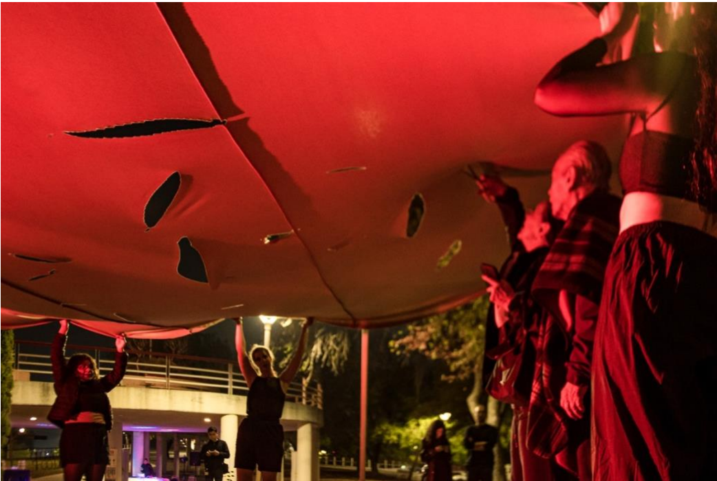
Performance Zurciendo Vacíos | Performer cutting slit in fabric