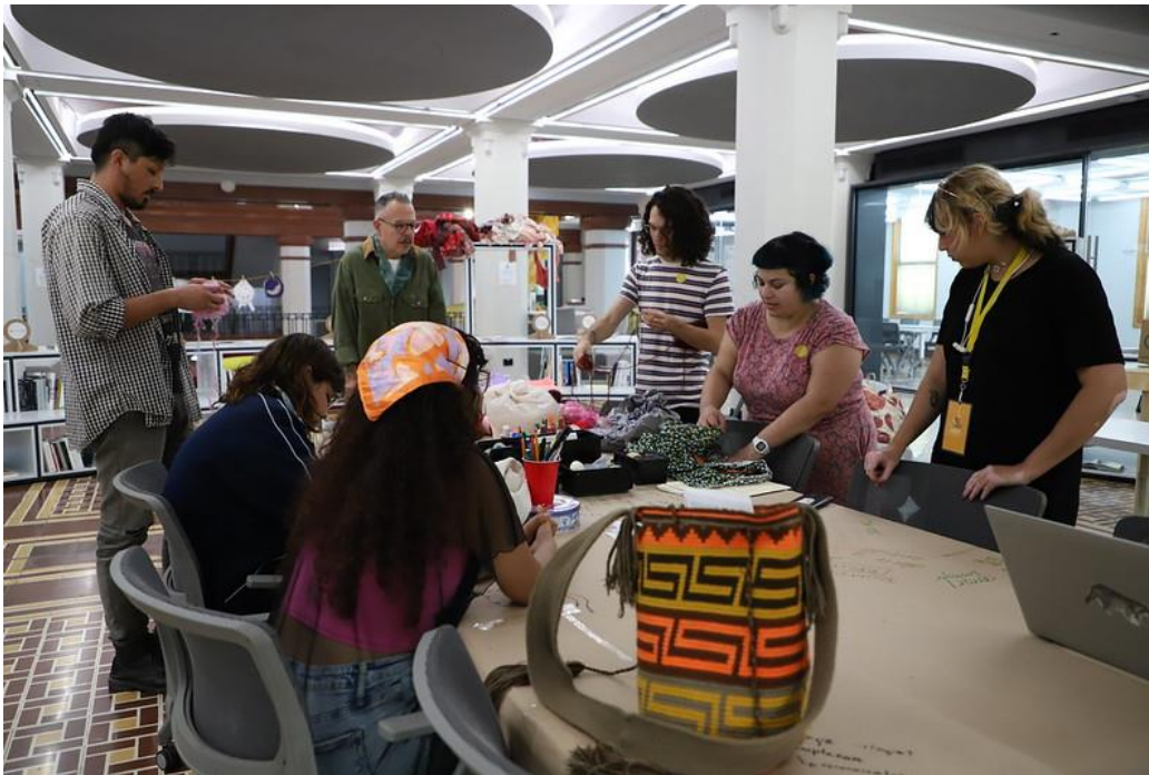
3 rd Prototype Session | Work in Progress