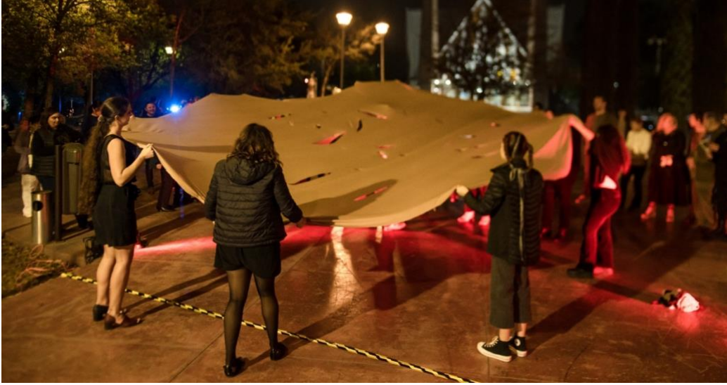
Performance Zurciendo Vacíos | Performers lowering fabric