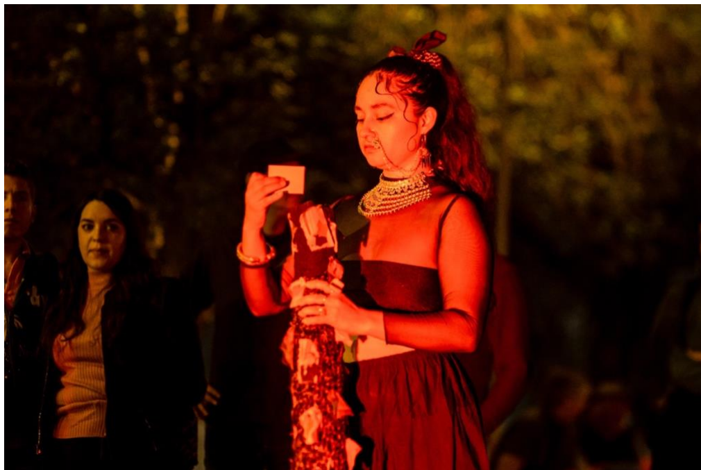
Performance Zurciendo Vacíos | Performer reading news of violence in Mexico