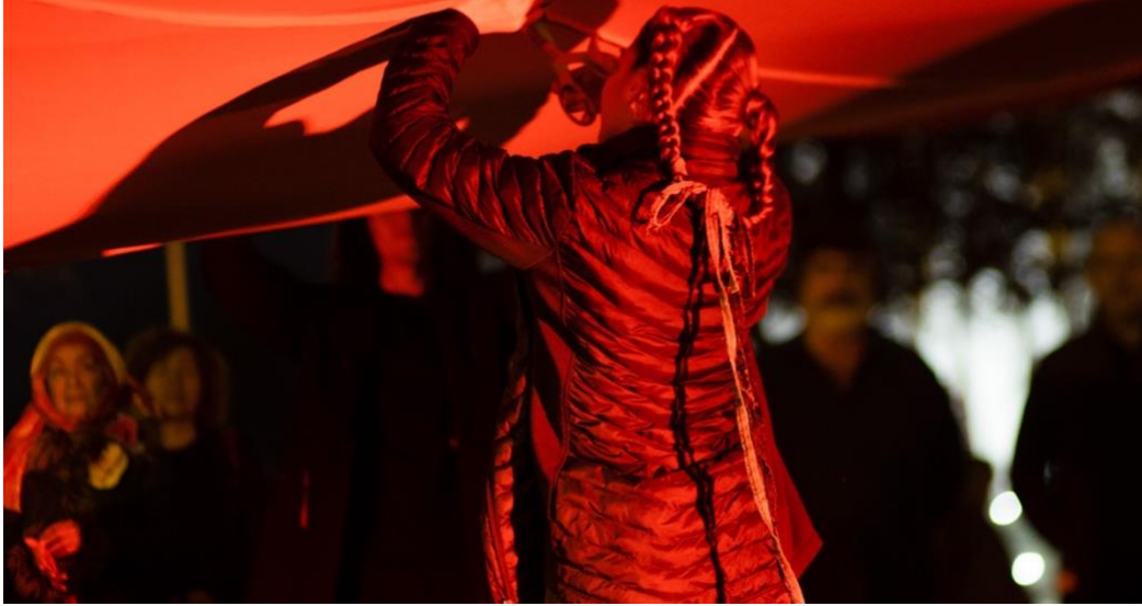
Performance Zurciendo Vacíos | Performer cutting slit in fabric