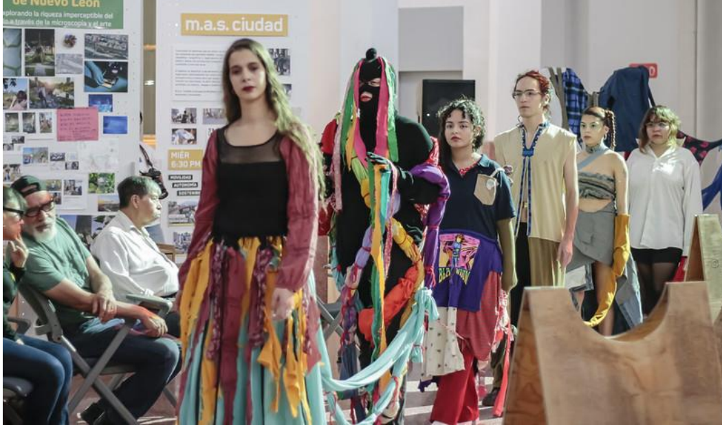
Zurciendo Vacíos Prototype Presentation | Final Performance