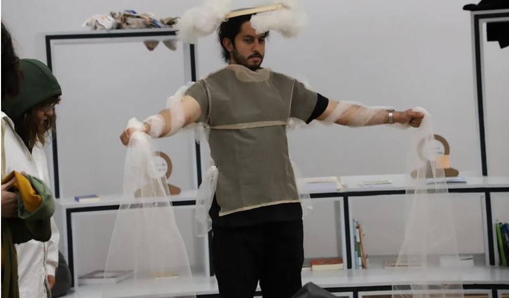
5 th Prototype Session | Testing prototypes connections