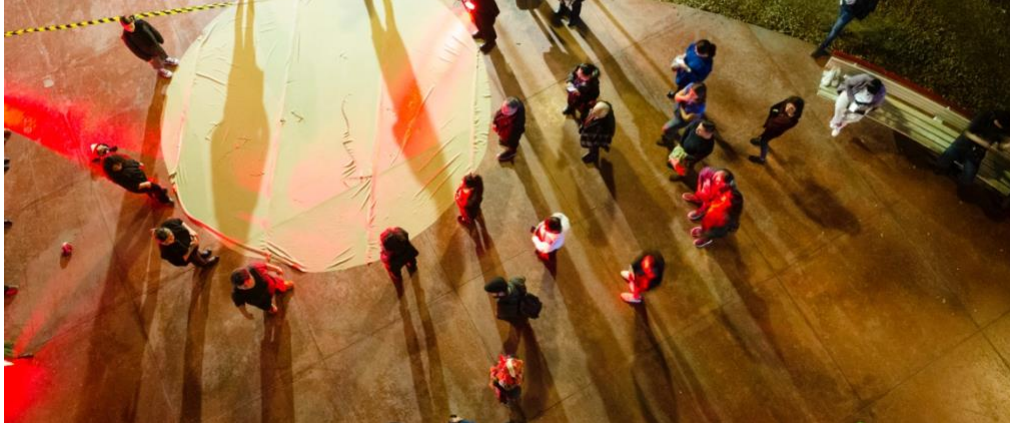
Performance Zurciendo Vacíos | Beginning | Gardens Centro Cultural Plaza Fátima