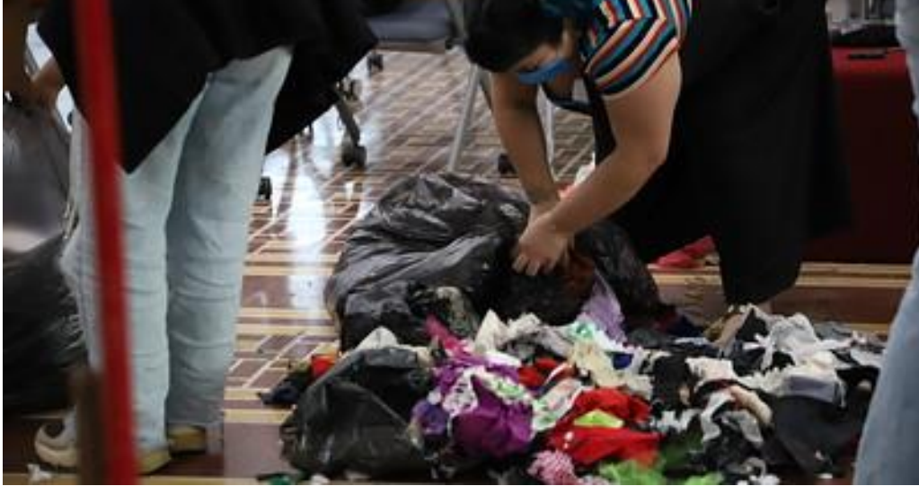
2 nd Prototype Session | Emptying 'Abrazo Entramado' (Wove Hug 1.0) and selecting fabrics that could be reused