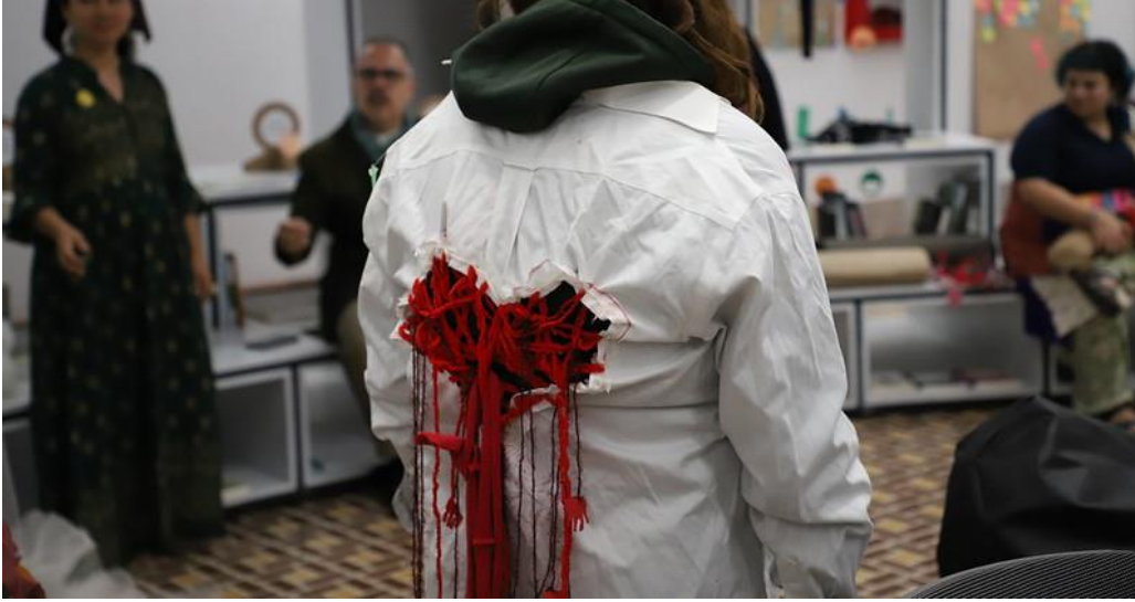
5 th Prototype Session | Testing prototypes connections