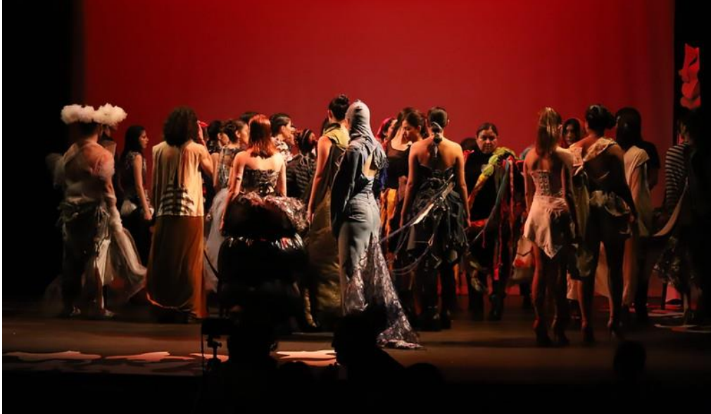
Experimental Catwalk Zurciendo Vacíos | All pieces together on stage