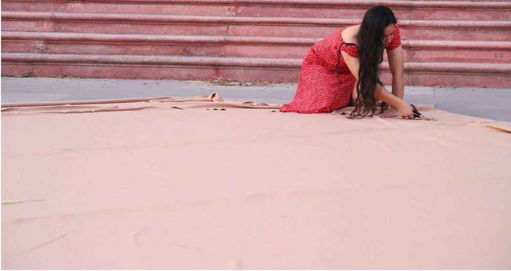
4 th Prototype Session | Preparing performance fabric