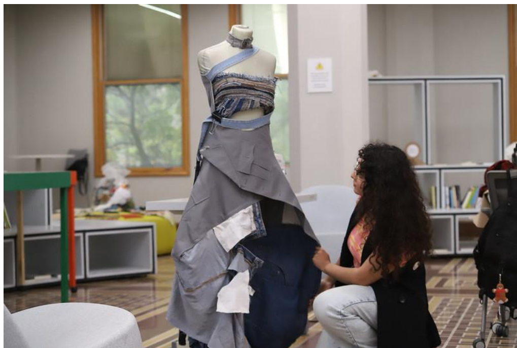
5 th Prototype Session | Testing prototypes connections