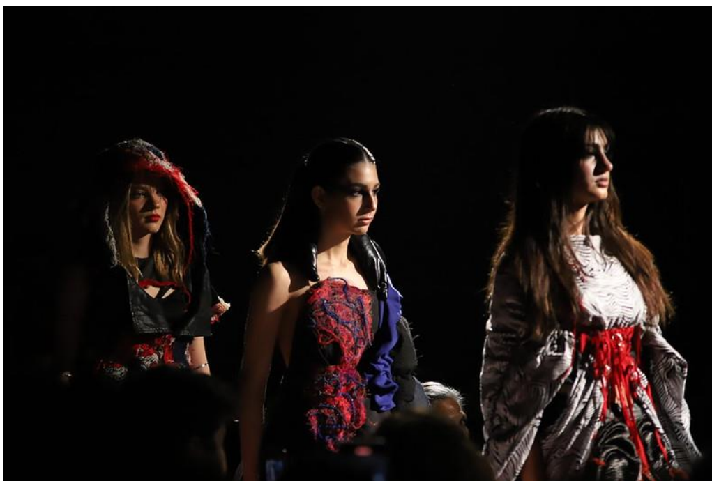
Experimental Catwalk Zurciendo Vacíos | Amphitheatre Centro Cultural Plaza Fátima