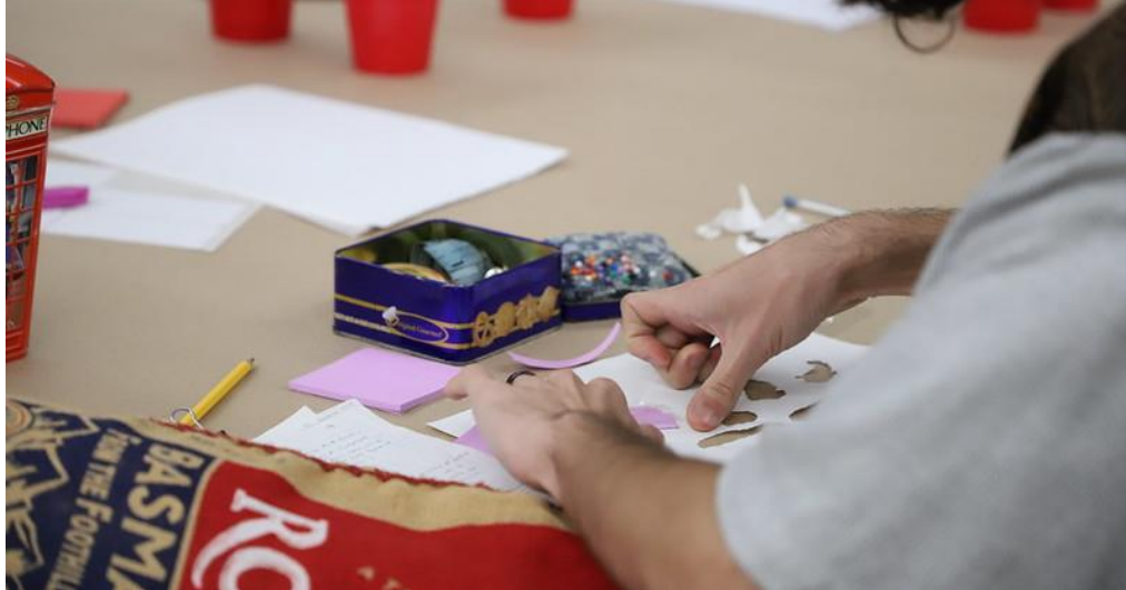
1 st Prototype Session | Developing Question