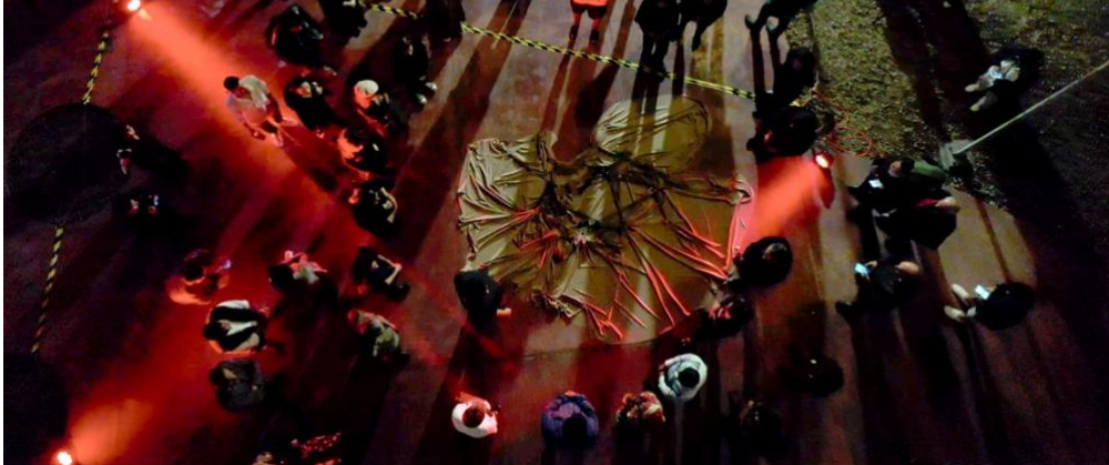
Performance Zurciendo Vacíos | Final scar